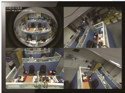
1 Panoramic camera