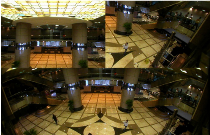
2D Strip View + 3D Perspective