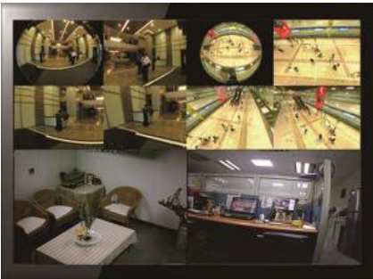
2 Panoramic + 2 Normal cameras