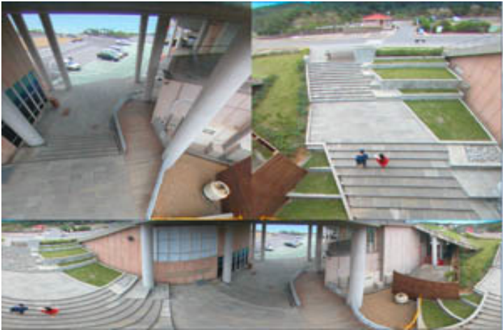
Global 2D + Two 3D-PTZ